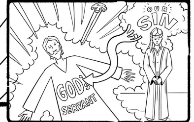
THE SUFFERING SERVANT (ISAIAH 53)

CAN YOU CONNECT THE FOUR OLD TESTAMENT PASSAGES TO THE CROSS AND THE RESURRECTION?