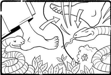
THE SERPENT CRUSHER (GENESIS 3:15)

"AND BEGINNING WITH MOSES AND ALL THE PROPHETS, HE EXPLAINED TO THEM WHAT WAS SAID IN ALL THE SCRIPTURES CONCERNING HIMSELF".