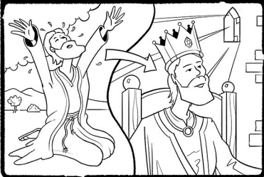
THE SUFFERING KING (PSALM 22)